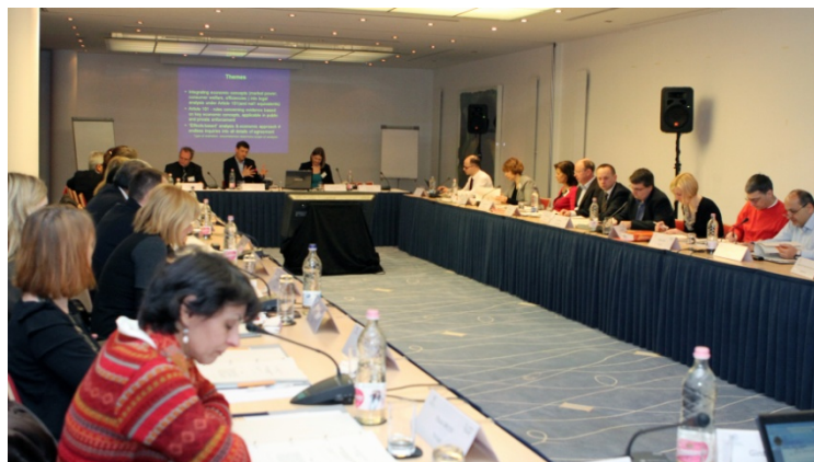
Seminar on European Competition Law for National Judges 22-23 February 2013