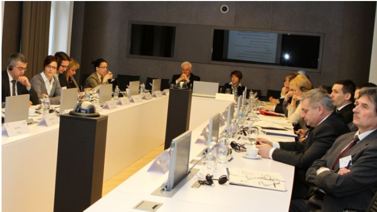
Heads of Authorities' Meeting 21 January 2013